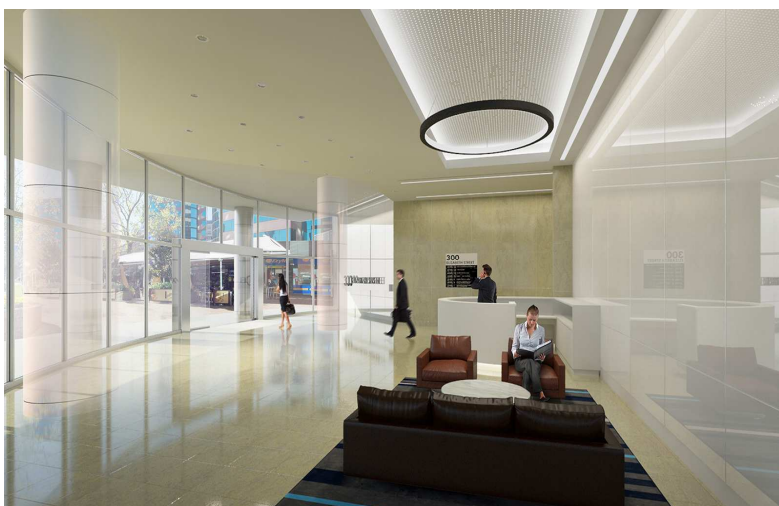
Tower C Lobby Image

Lobby Upgrade works commenced 25 May 2015 on both Towers and works will continue simultaneously until handover in early September 2015. The works include new ceilings, lighting, floor (Tower B) and wall upgrades and new furniture and directories. We appreciate everyone's patience during the works program and if you have any questions in the interim please contact Building Management anytime on (02) 9281 8600.